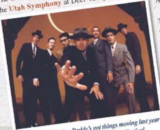
The Big Bad Voodoo Daddy's got things moving last year At Deer Valley during the 2008 Jazz Festival.

The Utah Symphony will have 11 performances at Deer Valley this summer. Special guest stars playing with the Utah Symphony at Deer Valley will include: Abba on July 18, Leann Rimes July 25, Gershwin evening August 14th and Elvis Costello August 15.